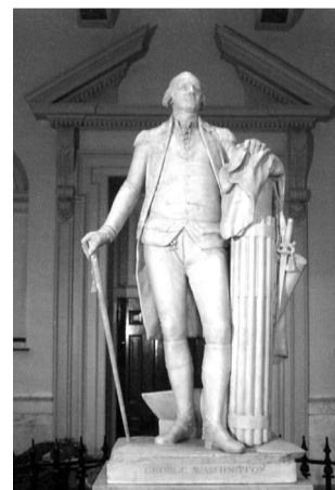
fig.2- Jean-Antoine Houdon Georges Washington Richmond, Capitol