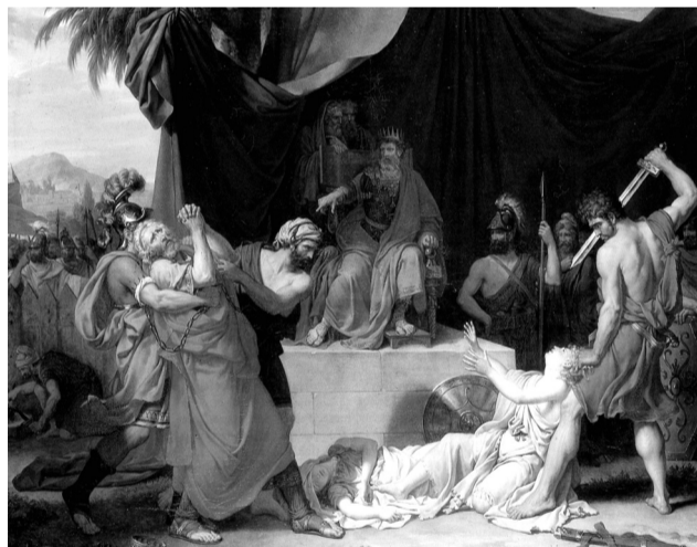
fig.1- François Xavier Fabre Nebuchadnezzar Ordering the Execution of Zedekiah's Children Paris, Ecole Nationale Supérieure des Beaux-Arts

While Fabre's (1766-1837) fame as a collector and donor to his native city have long outshone his talents as a painter, he indeed remains one of the best exponents of the Neoclassical movement. Thanks to Joubert, from the age of seventeen he attended one of the best schools of his day, namely the studio of David. Considered as one of the master's most promising pupils, he adopted his severe and realistic style after the Antique. In 1787 he won the Prix de Rome with Nebuchadnezzar Ordering the Execution of Zedekiah's Children (fig.1) and left for Italy where he would stay until 1822. Far from the secular rigours of the Revolution and Empire, Fabre was one of the few – if not the only – of David's disciples who delighted in painting both historical and religious episodes.