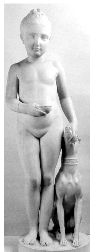
fig.3- Lorenzo Bartolini Napoleonic Princess Elisa Bacciochi Rennes, Musée des Beaux-Arts All rights reserved

While Lorenzo Bartolini (1777-1850) was not directly linked to Canova's entourage, he had an important role during the Empire. As the regime's official portraitist, he produced numerous effigies of Napoleon and the imperial family – his portrait of the emperor's sister probably being his most famous (fig.3) – and taught at the Academy of Sculpture decreed by the emperor at Carrara. His Recumbent Venus* after the painting by Titian is in keeping with the canons of Neoclassicism that he took pains to circulate, yet it also demonstrates the extent to which the great models of the Renaissance remained a source to imitate for this generation of artists.