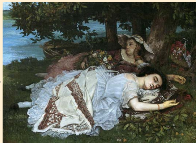
Gustave Courbet, Les Dames de la Seine, 1856-1857, Petit Palais - Musée des Beaux-Arts de la Ville de Paris

Prosecuted for participating in the Commune, he dies as an exile in Switzerland in 1877. A decade later, his work is rehabilitated and enters the Louvre Museum.