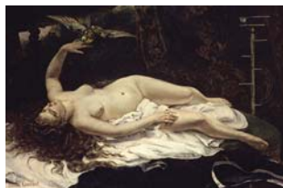
Gustave Courbet, La Femme au perroquet, 1866, © The Metropolitan Museum of Art, New York, H. O. Havemeyer Collection, legs de Mrs H. O. Havemeyer, 1929