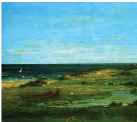
Gustave Courbet, Souvenir des Cabanes, 1857

Do not miss this historical exhibition and benefit from your stay in Montpellier to go along the Courbet road and discover the sceneries of the Languedoc which the painter has shown in his most famous works.