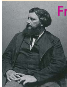
Portrait du peintre Gustave Courbet, 1856, Etienne Carjat, Musée d'Orsay, Paris, © Musée d'Orsay/D.R.